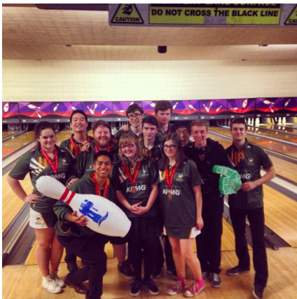
The University of Nottingham

After the women's trios, Loughborough have climbed to be in the lead adding a 1297 to their total, followed closely by Lincoln on a two person (plus 80 pin blind per game) score of 1249 for the trios. Nottingham have kept their place in the top 3, being on 1182 for their trios.