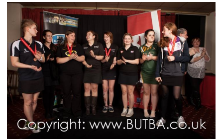
Women's Representative Squad

This year saw new awards given out at the Championships. The 'Highest Placed 2nd Team' went to Loughborough Men's B.