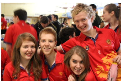
The University of Birmingham