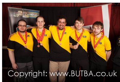
The University of Sheffield

After bowling brilliantly all year, nobody was surprised to see Nottingham at the top of the tables somewhere along the line. Their Women's team was in first place on 1319, ahead of the University of Lincoln. Just 80 pins behind Lincoln were Loughborough.