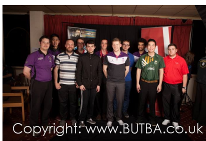
Men's Representative Squad