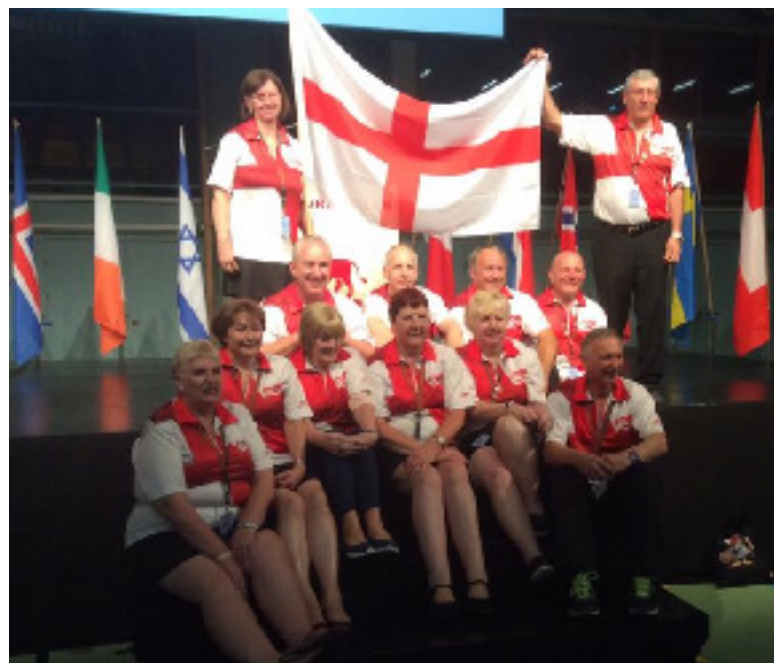
Senior Team England, ESBC, Copenhagen