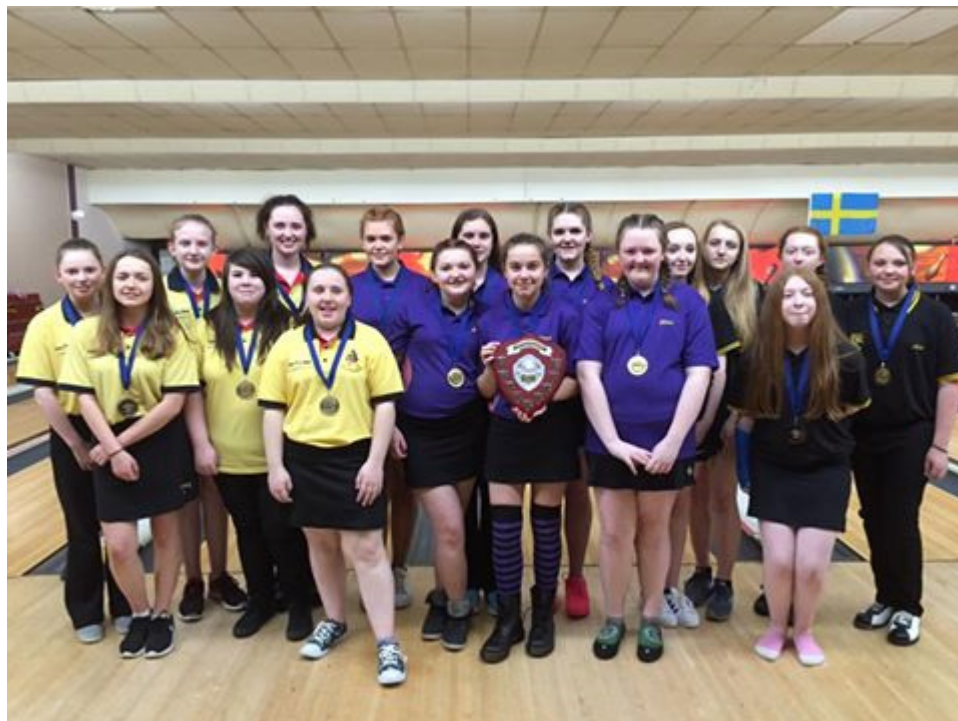
1st Place Hampshire. 2nd Place Yorkshire, 3rd Place Norfolk