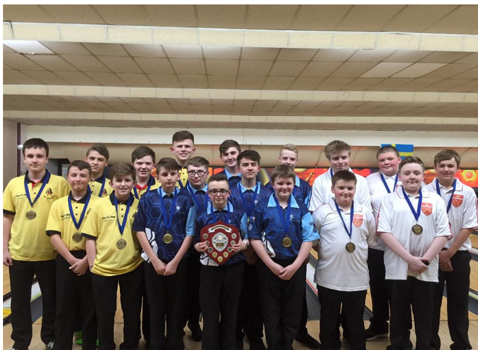
1st Place Yorkshire, 2nd Place Lincolnshire, 3rd Place Sussex