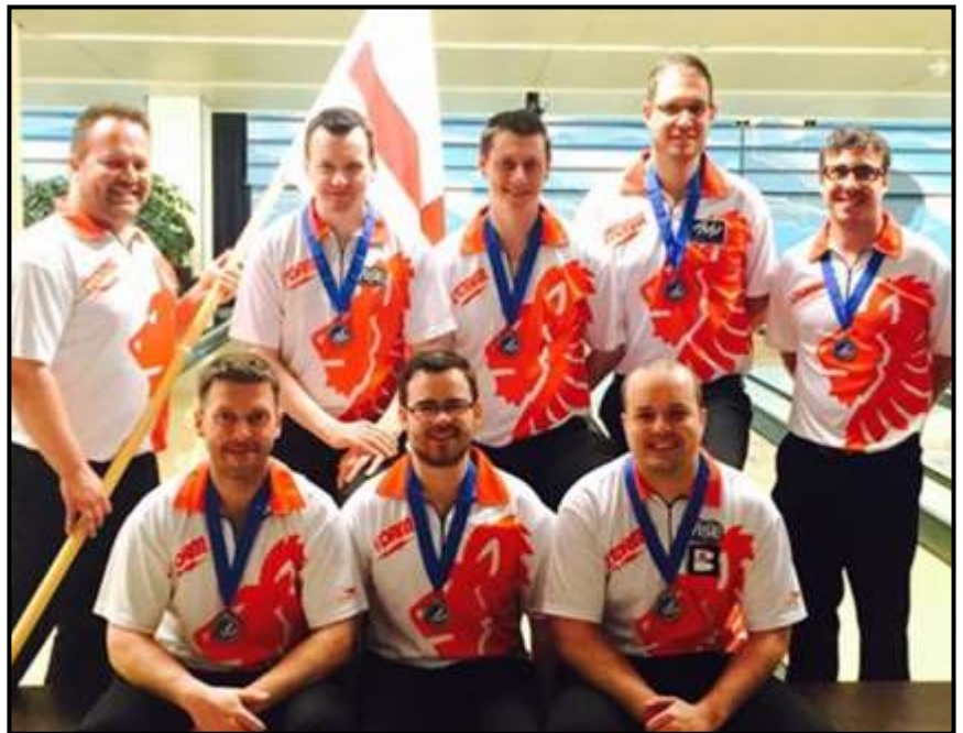
Storm Team England taking Silver in Denmark!

In the semi-finals, England defeated Denmark comfortably 1139-957 to setup a final with Finland, who had defeated Sweden 1072-1037. In a stunning final that was impossible to