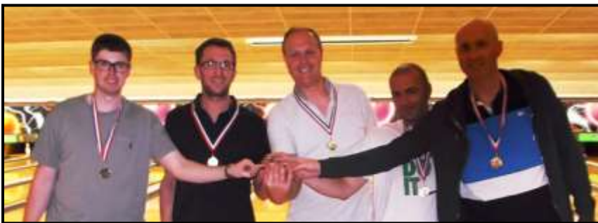
The winning Essex team

Well done to all the Dunstable YBC juniors, coaches and helpers.