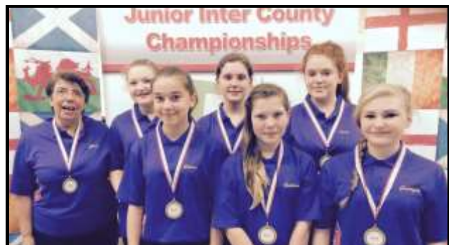
Girls Third Place - Hampshire