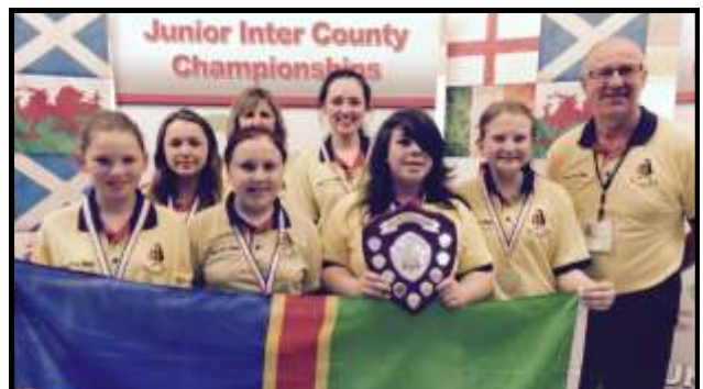
Girls Champions - Lincolnshire