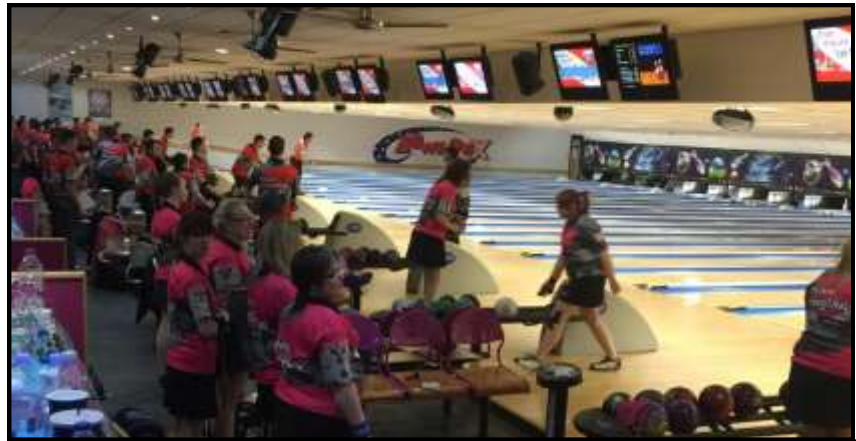
WTBA London underway...

Thanks very much to Bowlplex Poole for a well-run weekend, and to all the bowlers for making a great first weekend. The second trial will be held at Tolworth in July; we'll see you there!