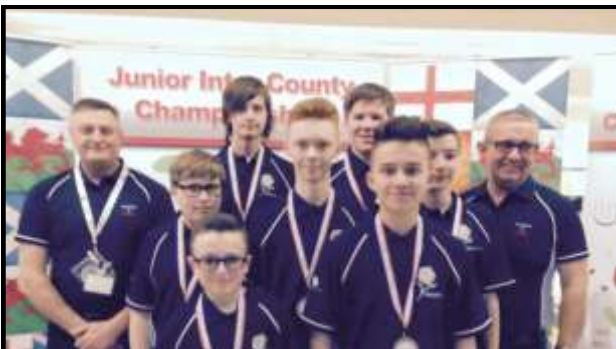
Boys Second Place - Yorkshire