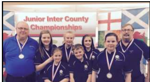
Girls Second Place - Yorkshire