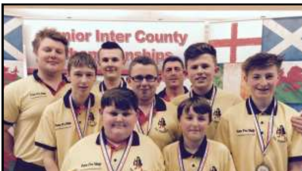
Boys Third Place - Lincolnshire