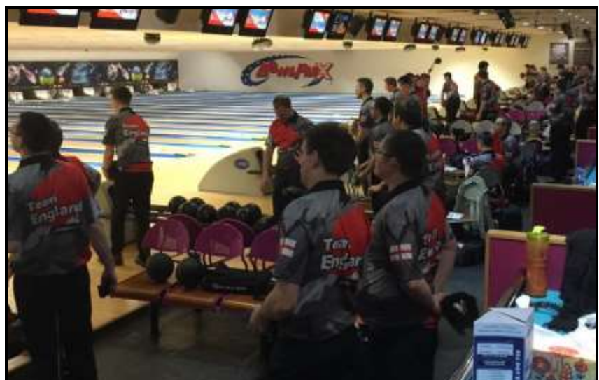
WTBA Stockholm underway...