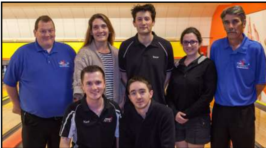
First FUNdamentals Instructor Workshop heralds the dawn of a new era

Sunday May 10th 2015 will prove to be a landmark date in the history of B.T.B.A. coaching as the first five FUNdamentals Instructors completed their learning with a 6-hour workshop at Namco Norwich Bowl.