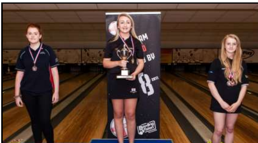
Junior Girls - All Events