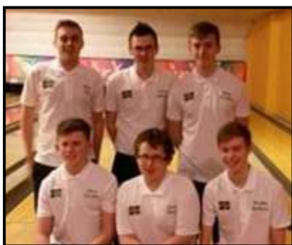
Lincolnshire YAC Boys

After an absolutely shattering weekend during which the lads played 5 games on the Saturday and 2 more on the Sunday morning to qualify, then 7 more games in a Round Robin Final, Lincolnshire YAC finished in a cluster of teams on 4 points – all the more heartbreaking because they had lost their first two head-to-heads by 4 pins and 13 pins.