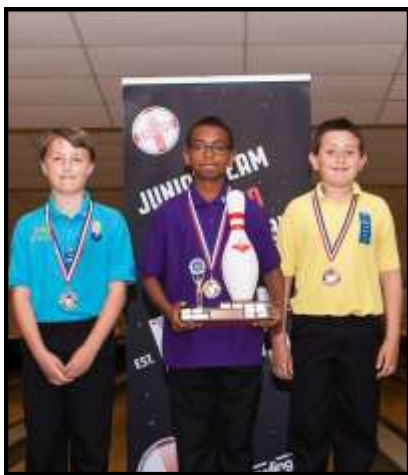
Junior Boys - Singles