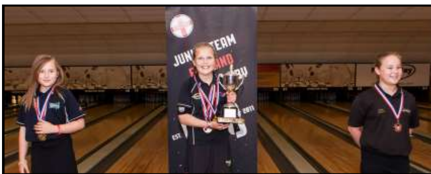
Bantam Girls - All Events