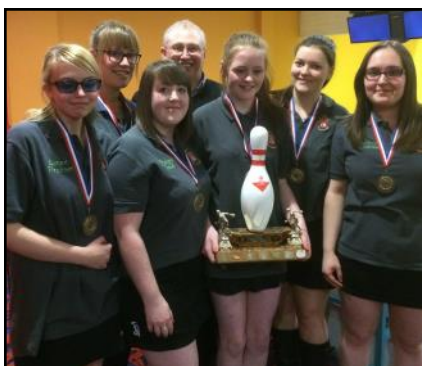
Women's Champions - Warwickshire