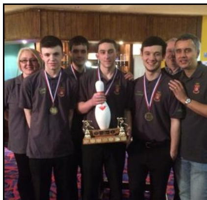
Men's Champions - Warwickshire

With the round-robin completed it was Warwickshire's men and ladies that took the Championship titles with round-robin totals of 5791 and 3914 respectively. Full results available at www.btba.org.uk