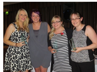
Winners: England Ladies EWC Team